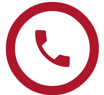
Two-way voice calling