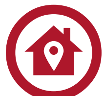
Indoor location compatible